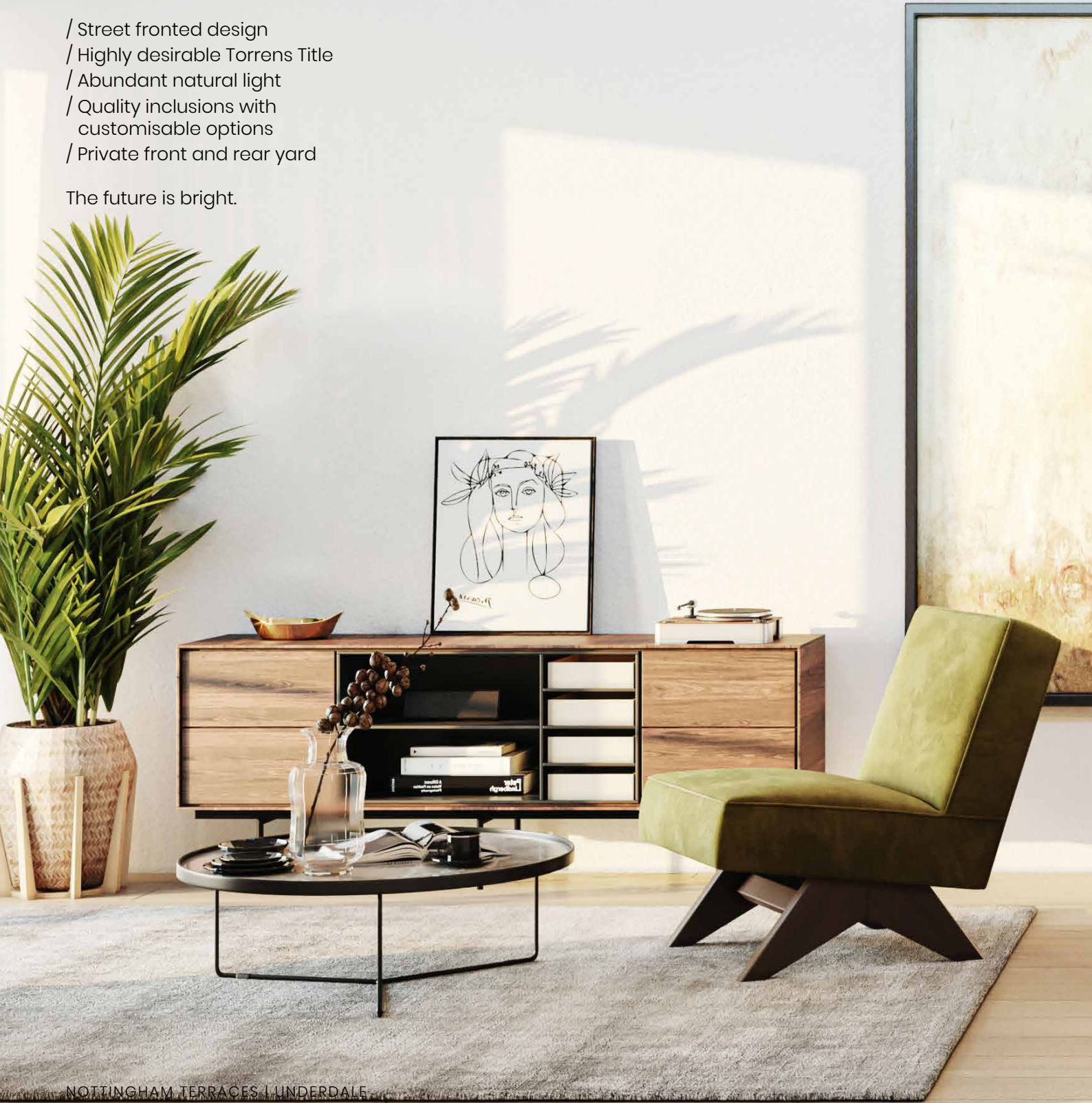
NOTTINGHAM TERRACES | UNDERDALE